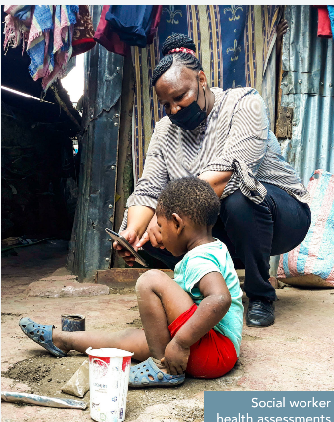
Social worker health assessments