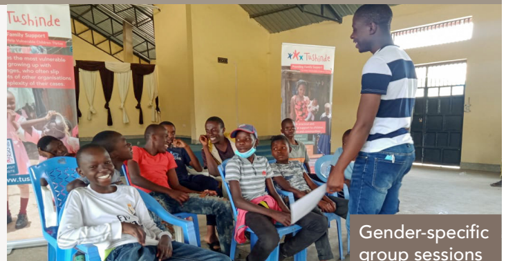
Gender-specific group sessions