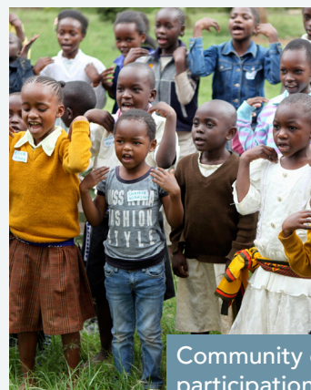
Community days to encourage participation and positive networks