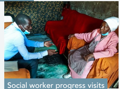
Social worker progress visits