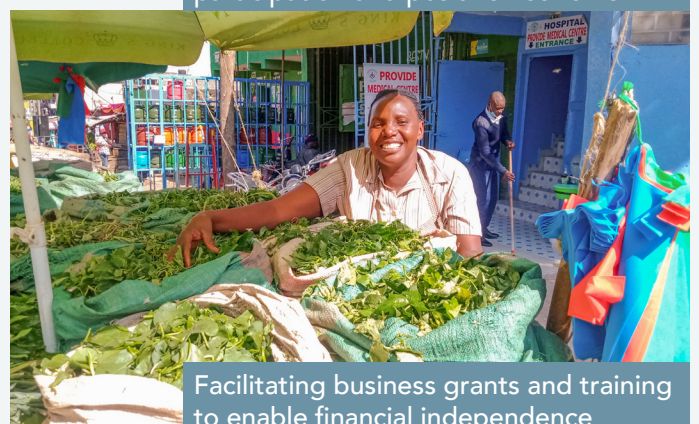
Facilitating business grants and training to enable financial independence