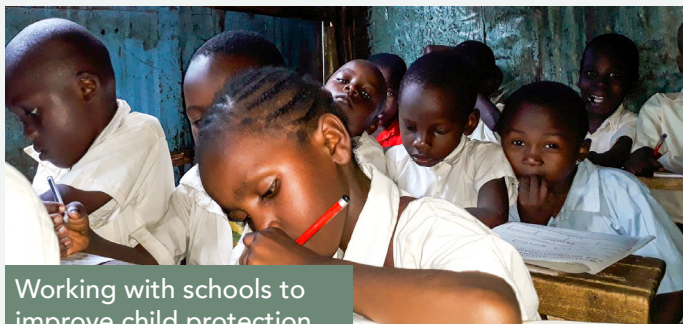
Working with schools to improve child protection

In some cases, the family situation is so high-risk that the children need to be found a place of safety quickly whilst work is done to make the family environment stable and nurturing. Tushinde is hoping to add a foster care element to its programme so that there is a safety net for all children. Kenya's Care Reform Act 2022 offers guidance on how to provide such care legally and sets a framework for Tushinde to support the children most at need when they need it.